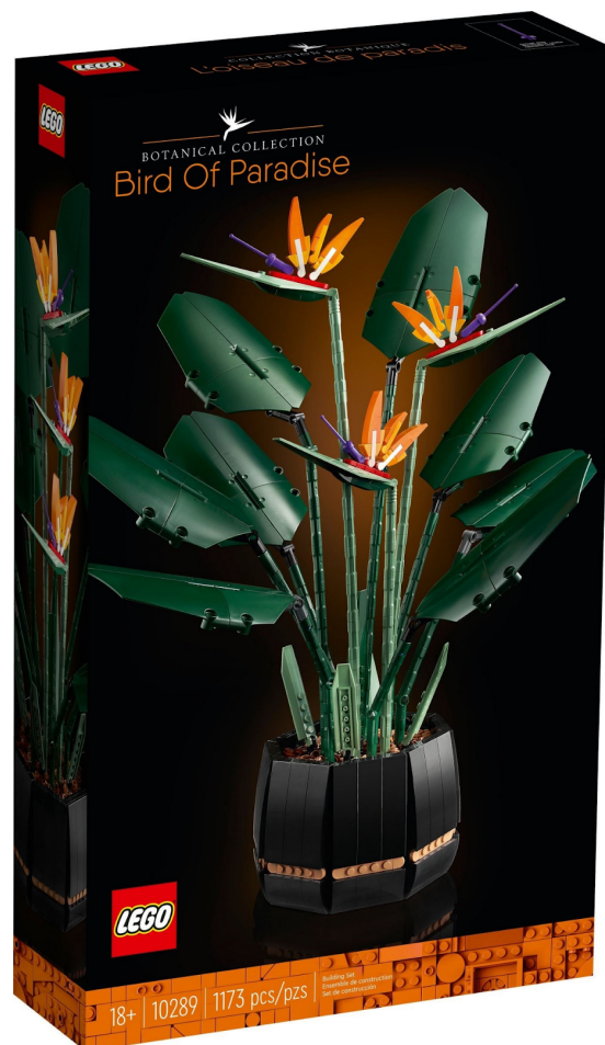
10289 Bird of Paradise, from the Botanical Collection

The “Adults Welcome” initiative primarily served as a way for LEGO to encourage adults who had not grown up with LEGO as a child to purchase the building toy as an adult. To do this, LEGO started producing larger, more expensive sets based on pop culture icons, famous vehicles, artistic display pieces, and other sets designed to draw in a more mature audience. Even the packaging was changed to look more minimalistic with a black background and sported an 18+ age rating.